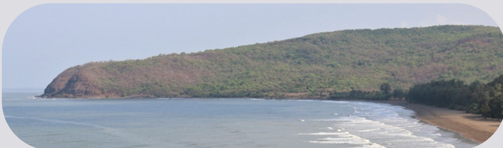
DIVEGAR & HARIHARESHWAR BEACH