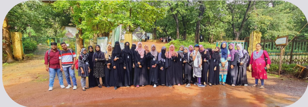
PHANSAD WILDLIFE SANCTUARY