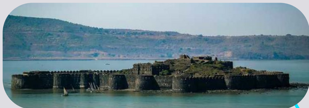
MURUD JANJIRA FORT